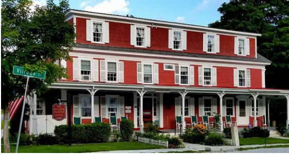
The Wilson House

Bill Wilson was born here on November 26, 1896 in East Dorset, Vermont. In his role as co-founder of Alcoholics Anonymous, Bill Wilson was by far one of the most influential people of the 20th century. In creating this program, Bill has been instrumental in literally saving the lives of millions of people across the globe and created a transformative, universal support system for those in recovery. The Twelve Step program he and Dr. Bob founded continues to do the same in the 21st century.